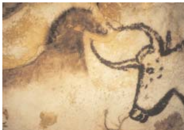
Figure 8. Prehistoric paintings in the cave in Lascaux (France, Magdalénien). Artists in prehistoric times used organic and inorganic pigments to make the beautiful mural paintings. On the unpainted sections of the rock surfaces, microbial growth has created bio-patina. The similarity of human paint (or treatment) to biological causes is clearly visible when analysed by microbiological work (POCHON, 1964).

In many publications and reports, the ICBM Geomicrobiology Group in Oldenburg has shown that pati-