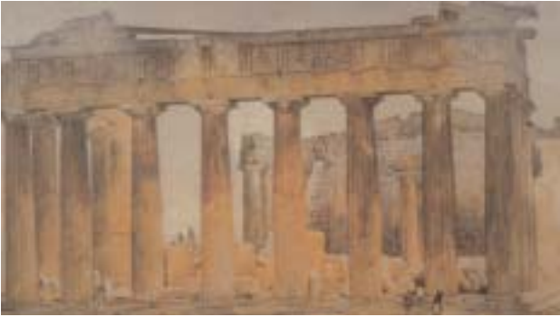
Figure 1. An early 19th century painting of the Parthenon, Athens. The Parthenon is depicted in the original colours of about 1840. At that time, biogenic patina covered the entire monument in yellow to brown pigments produced by microbial biofilms thriving at that time.