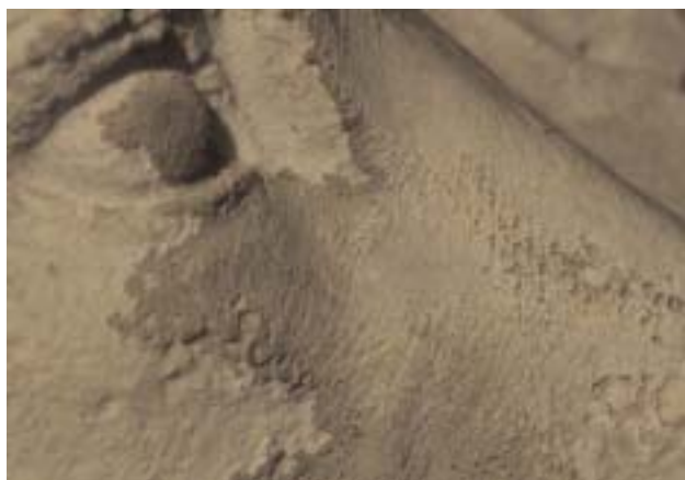
Figure 7. The skull of a horse at the Colonna Traiana in Rome. The horse skull (and especially the eye) exhibit (1) surface loss resulting from pollution and acid rain, and (2) different stages of bio-patina formation and bio-pitting of the patina as well as the original rock.

of Mediterranean rocks has often been assumed to be due to mere bacterial activity, since “no significant fungal growth” was reported (URZÍ, 1996). The authors even state that mainly chemo-organotrophic bacteria, cyanobacteria and algae are responsible for red, yellow and orange colour changes, while fungi are only responsible for dark brown to black patination, although it is generally agreed that carotene production is a feature of both the bacterial and the fungal kingdom.