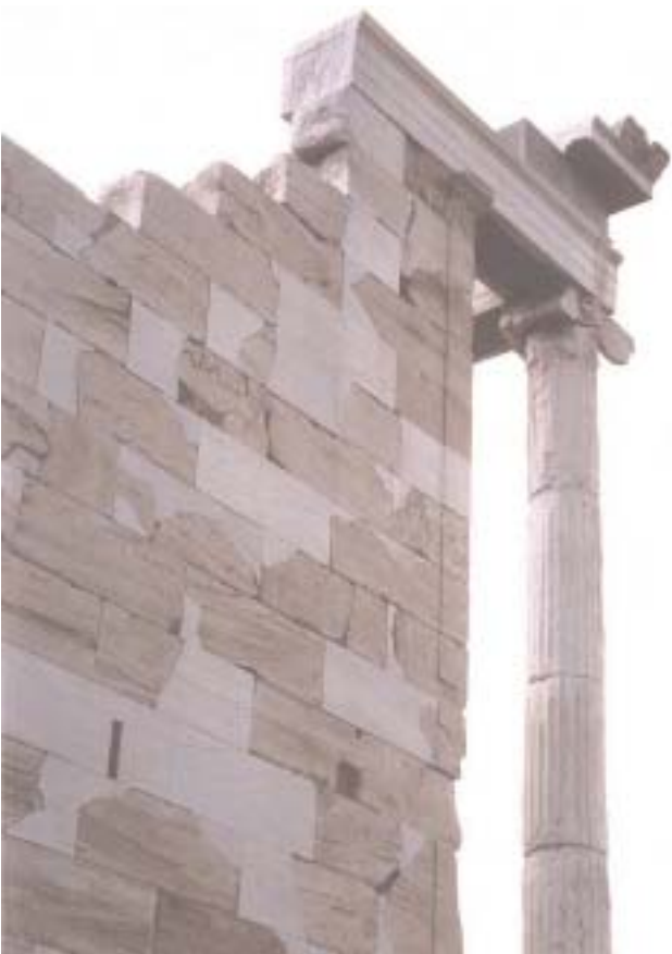
Figure 2. A fragment of the restored Acropolis (Athens), with original marble blocks as well as the Pentelic marble recently inserted to restore the architectural structure. The ancient marble pieces are bio-patinated, while the replacements still possess the colour of freshly quarried marble.