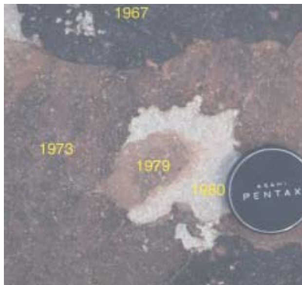
Figure 5. A petroglyph site in the Negev Desert in Israel monitored for the past 40 years by the Oldenburg Geomicrobiology Group. Subsequent petroglyph-like carvings and incisions were made at different time intervals to follow the development of organic biogenic patinas under natural environmental conditions.

These meristematically growing, yeast-like black fungi, the colour of which can vary from yellow, orange, rust-red and brown to totally black, seem to be the most predominant rock-dwellers worldwide, according to present research (Gorbushina 1993 and 2000). The typical surface changes, usually referred to as “soiling” (e.g. in monuments in Scotland, England and Germany) always seem to be related to fungal growth resulting from heavy organic pollution of the atmosphere, especially in major cities (KRUMBEIN, 1966; KRUMBEIN, 1995 and 1996). A case of rapid patination caused by black fungi was observed at the monastery of St. Trophime (Arles, France). Only three months after cleaning the surfaces of the sculptures, new black spots occurred. The fresh spots were easily identified as fungal colonies of Nigrospora sp. by the author along with a microbiologist from the LRMH research group at Champs-sur-Marne (G. Oriol) and C. Urzì, Messina. Another case was reported in the “Neue Pinakothek” (Munich), where serious black stains developed within a year or two after the erection of the building complex (BRAAMS, 1992). In this case, the black patina was not caused by black yeast, but rather by a close relative ( Exophiala jeanselmii ).