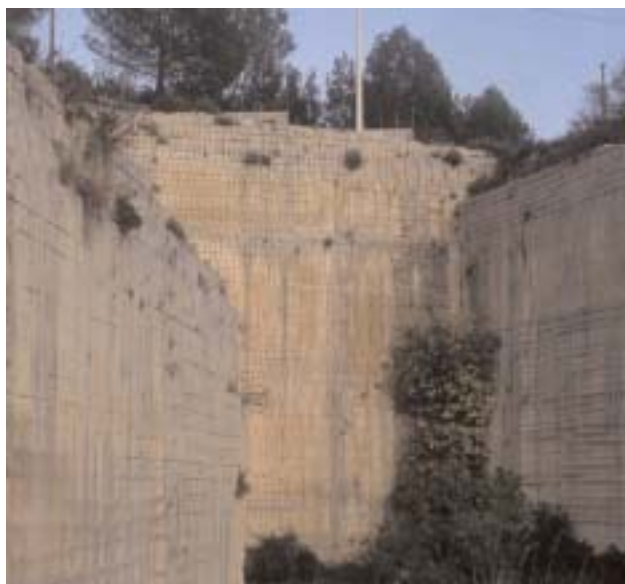
Figure 4. A quarry near Piazza Armerina in Sicily with typical (humidity-related) organic pigments produced by bacteria and fungi biofilms, which have colonised the abandoned quarry rock surfaces for about the past 50 years. The pigmentation thus represents an evolutionary history of no more than half a century.

1992 to incorporate comparative research activities on poikilophilic subaerial black fungi from European monuments as well as natural rock outcrops in Russia, the Ukraine, the Negev Desert (Israel), the Mohave Desert (USA), the Namib Desert (Africa), and the Gobi Desert (Mongolia) (GORBUSHINA, 2000).