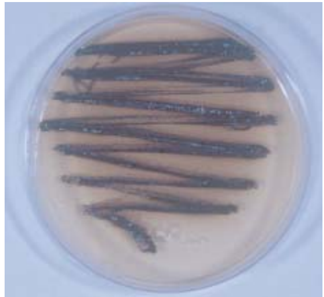
Figure 6. A colony of a melanin-producing fungus isolated from a rock surface and transferred to the laboratory in order to imitate natural bio-patination processes.