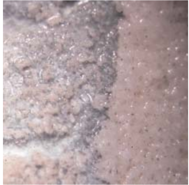
Figure 10. A rock specimen from which a lichen similar to that in Figure 9 was removed with a steel brush. The sub-surface area of the lichen exhibits the same pattern of bio-pitting and growth as the zones adjacent to it and to the lichen in Figure 7. It can thus be concluded that a lichen cover, including pigment-producing, free-living black fungi, can produce uniform yellow, orange, brown and even black patina (see also Figure 5).